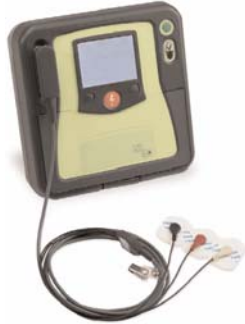
AED Pro with 3-Lead ECG