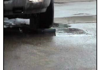
Rollover AED Pro